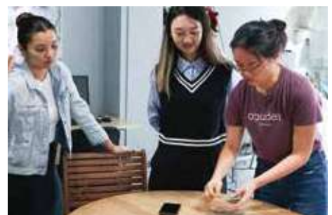
Motivation Game @ Raffles Wellness Month