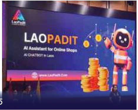
KOREA-ASEAN AI Youth FESTA 2025