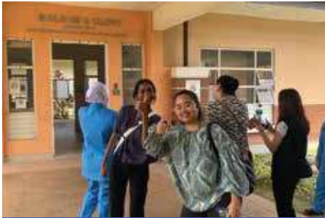
Field trip at Permai Psychiatric Hospital, Johor Bahru