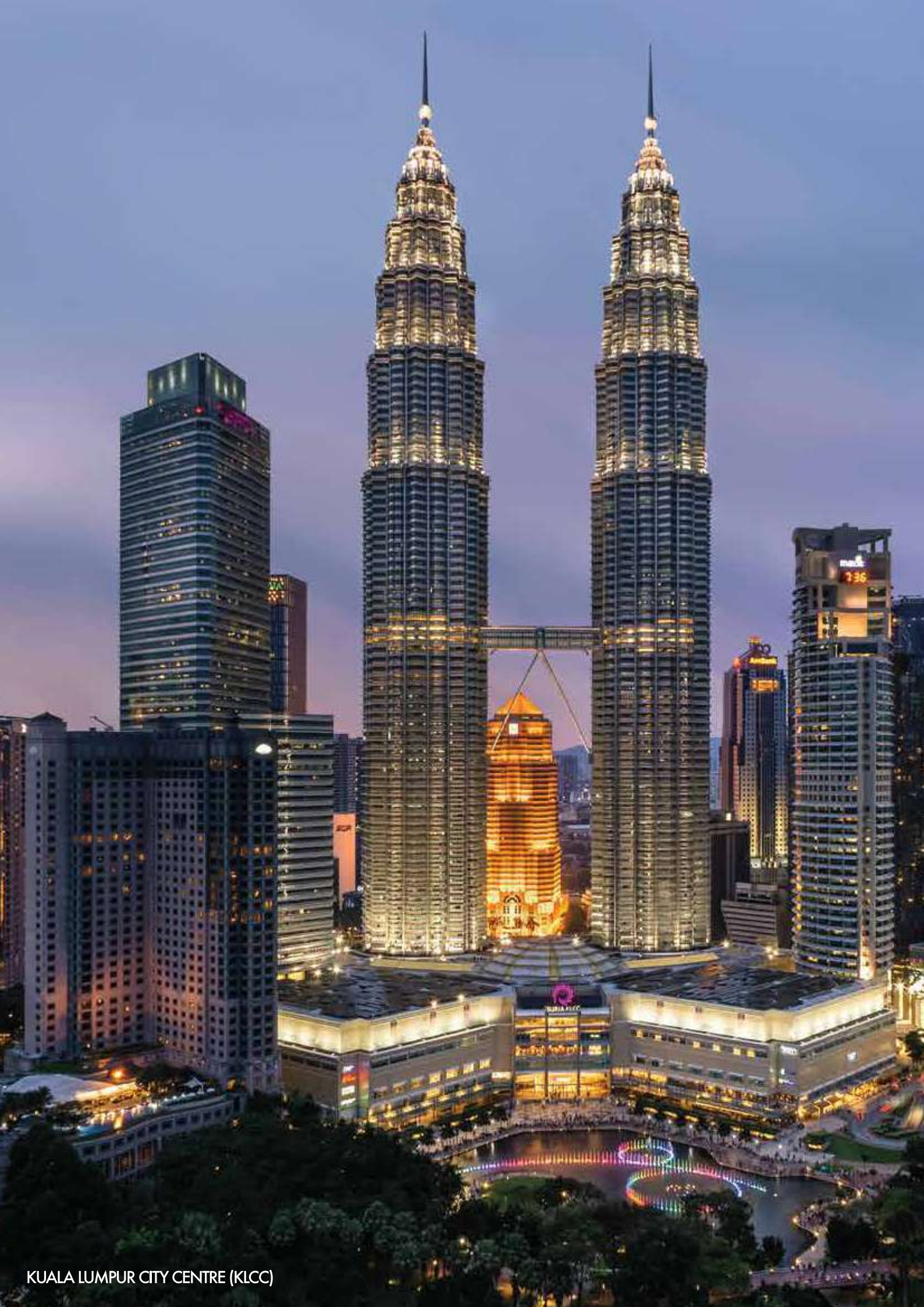
KUALA LUMPUR CITY CENTRE (KLCC)