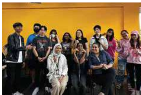
Meet and Greet