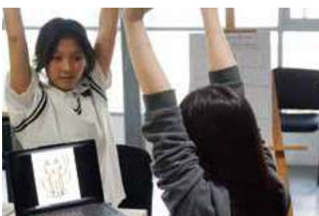
Wellness Trail @ Raffles Wellness Month