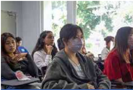
Forum on Mental Wellness