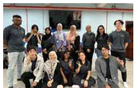
Psychoeducation on Emotional Regulation and Sexual Education at Rumah Kanak Kanak Mini Cheras