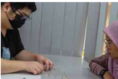
Matchstick Experiment to Explore Insight for Cognitive Psychology