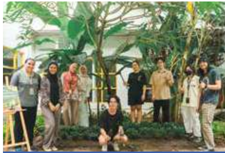
Grow Together @ Raffles Wellness Month