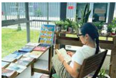
Grow Together 2.0 @ Raffles Wellness Month