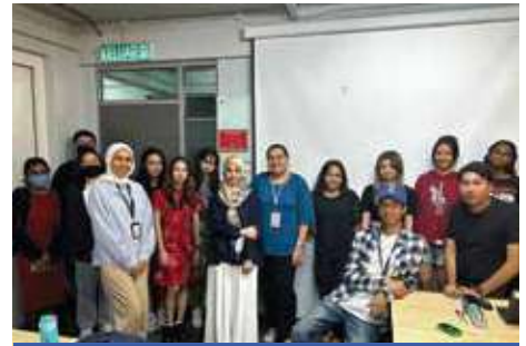
Guest Lecture on Perception and Brain Related Disorders