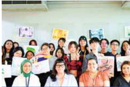
Healing Through Art @ Raffles Wellness Month