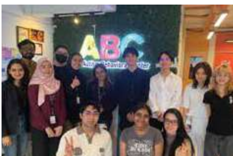
Autism Behavioral Center