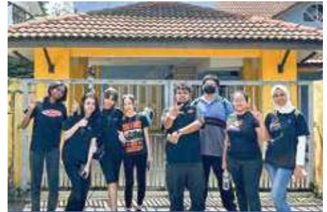
IDEAS Autism Center