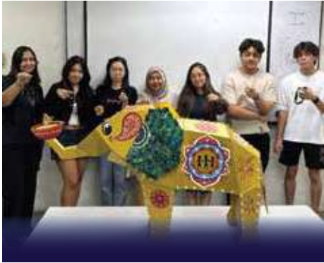
Deepavali Elephant Art Project