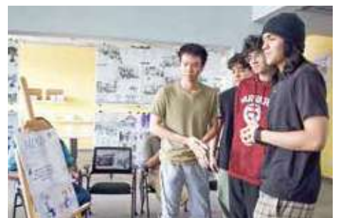
Mind Check-In @ Raffles Wellness Month